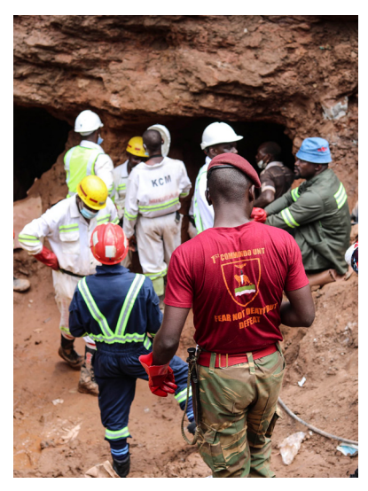
Not digging it: No water, no power. No power, no mine