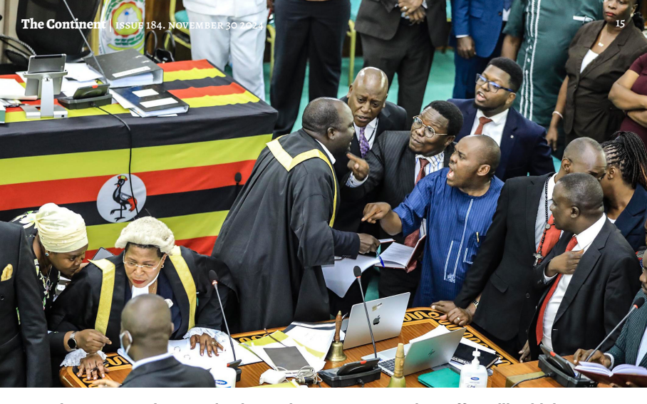
Stand your grounds: Ugandan lawmakers argue over the Coffee Bill, which Baganda leaders believe will threaten their autonomy and agency in coffeegrowing regions.

in the mid-1960s, dispatched an army battalion to attack the palace of the Kabaka of Buganda, driving the king into exile. That battalion was led by a young army officer called Idi Amin Dada.