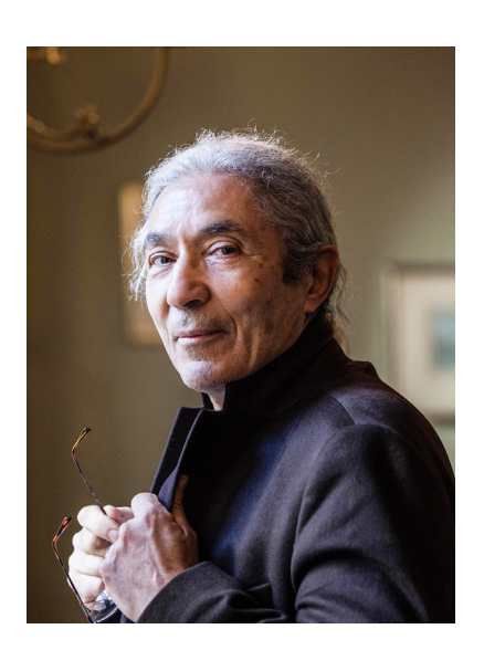
Missing: Algerian writer and critic of the state Boualem Sansal has not been heard from in weeks.

With its prisons holding more than three times the capacity they were built for, the Burundian government decided it would release 40% of the incarcerated people as long as they are accused of petty crimes. This week, President Évariste Ndayishimiye said in a post on X that 4,000 had walked free. Another 1,500 are expected to be released, but they are unlikely to include the thousands of political prisoners who might threaten the Ndayishimiye's power.