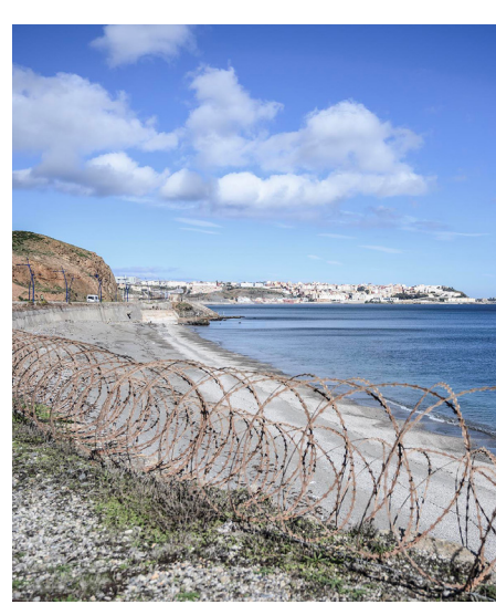
The razor's edge: Ceuta seafront, along Fnideq's coastline, is wired shut

Today access to Ceuta and Melilla requires a visa. Since April 2024, Moroccan authorities have refused to accept the special 24-hour pass issued by Spanish consulates in Tetouan and