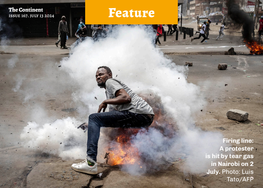
Firing line: A protester is hit by tear gas in Nairobi on 2 July.