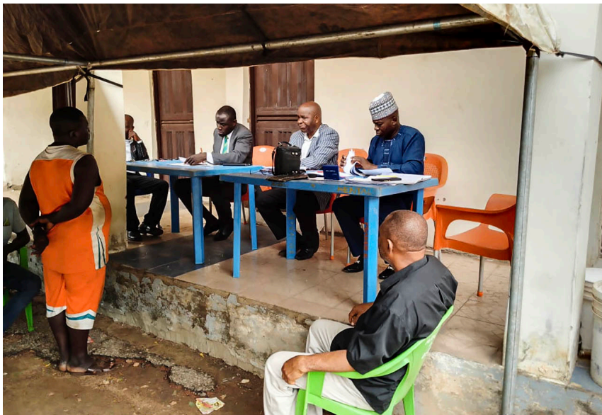
Everything's fine: Mobile courts offer "quick results".