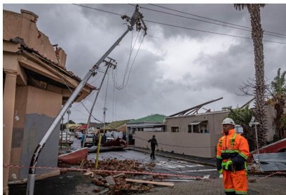
Cape of Storms: Howling winds and torrential rains destroyed thousands of buildings in Cape Town.

right Democratic Alliance, now part of South Africa's ruling coalition. The party has governed the Western Cape for 15 years and has repeatedly come under fire for policies and conduct critics say favour the rich.