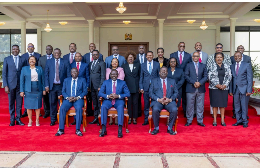
Big shots fired: President William Ruto (seated, centre) and his cabinet, shortly after his electoral win. This week he sacked them all, except two.