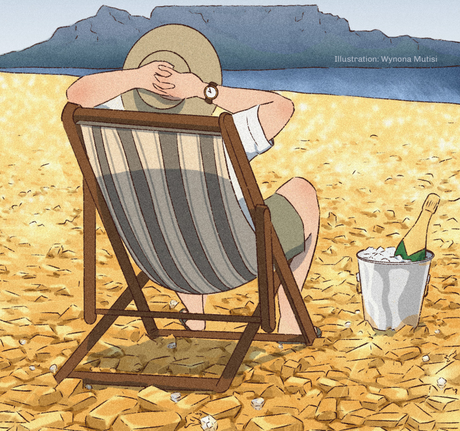
Illustration: Wynona Mutisi

Accused of DRC war-profiteering but living the good Mzansi life