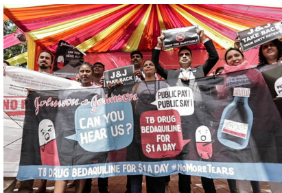
Fair's fair: The Competition Commission sided with health activists.

The Competition Commission said that “moving forward the commission may seek penalties if pharmaceutical companies continue to pursue meritless secondary patents”. ■