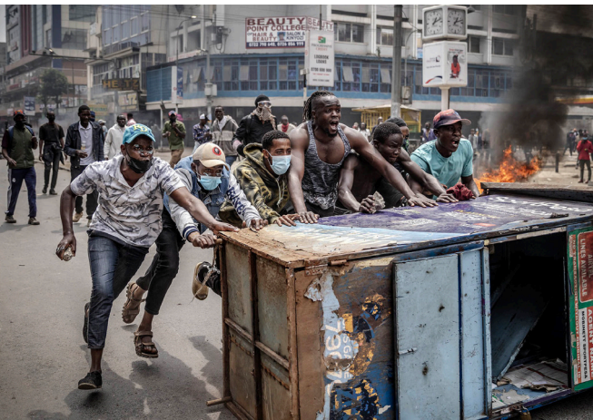
Stacking the odds: Protesters form a barricade against police during demonstrations against the Finance Bill.