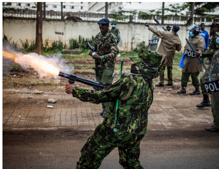
Hard line: Kenyan police fire tear gas at people protesting against the Finance Bill on 20 June.