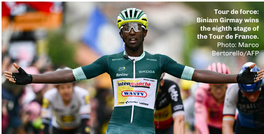
Tour de force: Biniam Girmay wins the eighth stage of the Tour de France.

competition in the 231km stage three, the 183.4km stage 8 and the 204km stage 12. He is the first black person to win a stage (or three) in the history of the world's best-known cycling race. Celebrating on social media, Girmay said: "Let me open the door." He will leave the race with the ultimate sprinter's prize: the green jersey.